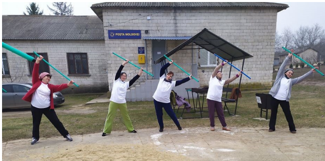
Picture 1: CDSMP participants practice physical activity, Healthy Life - May 2018

For 6 weeks between March and April 2018, group of patients guided by two trained peer facilitators, engaged in workshops emphasizing individual planning and action-taking to achieve lifestyle changes. The pilot intervention was implemented in the localities of Susleni, Boscana, Peresecina, Ohrincea and Marandeni.